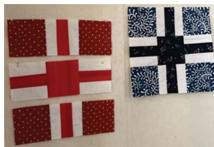
May Block of the Month