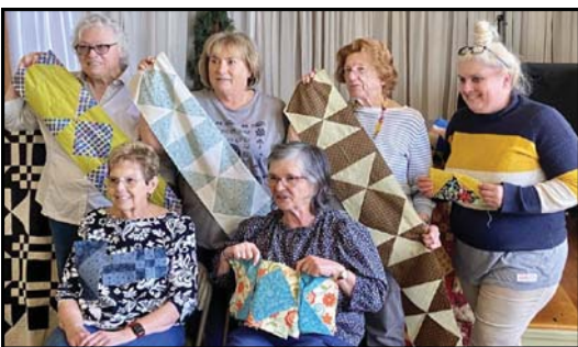
Beautiful strips of blocks completed at the Workshop!