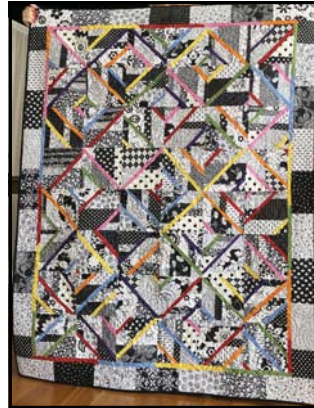
Best of the Valley Entries and Awards!