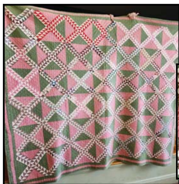
Close-ups show the incredible hand stitching.